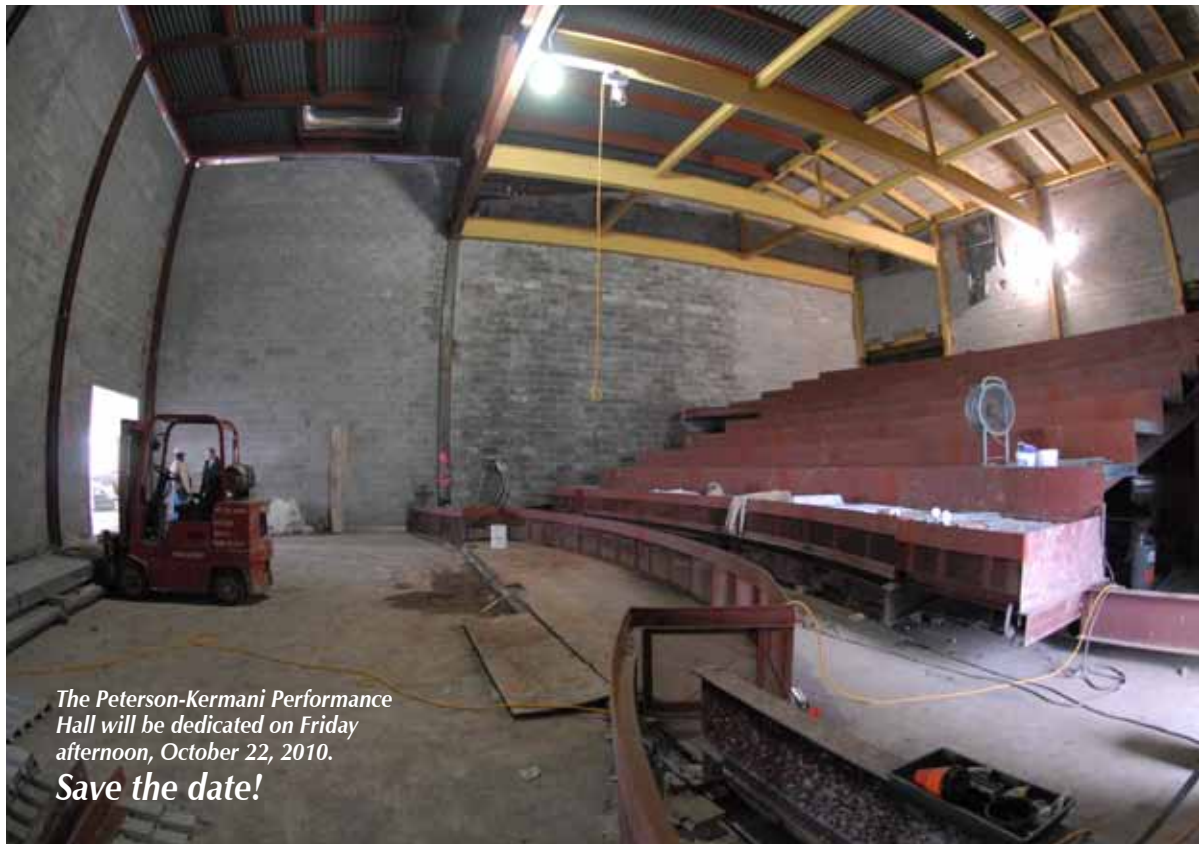
The Peterson-Kermani Performance Hall will be dedicated on Friday afternoon, October 22, 2010. Save the date!